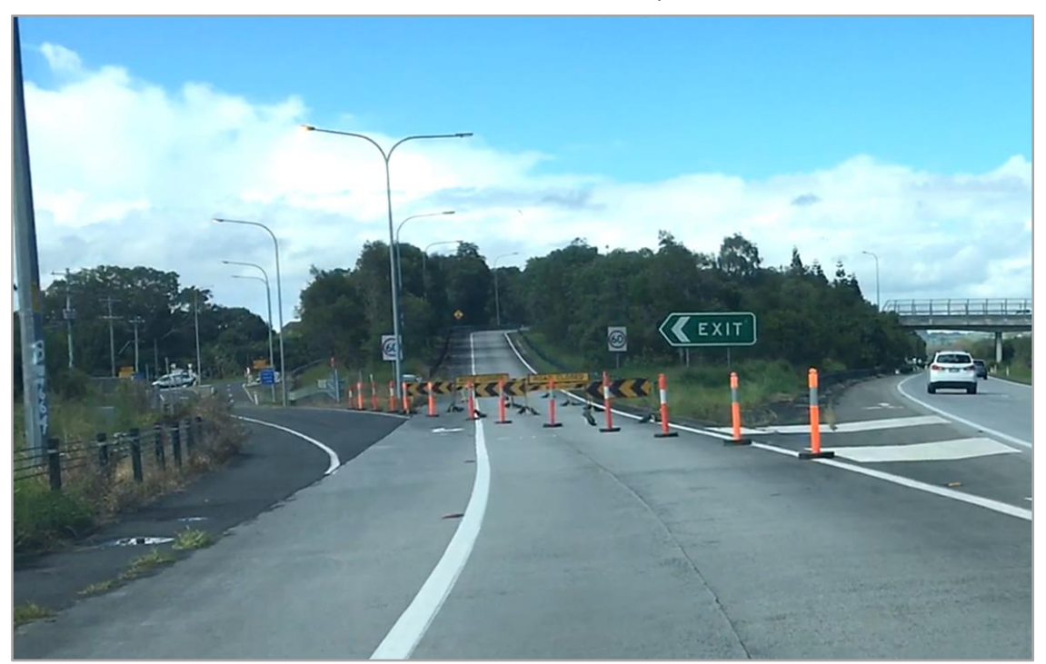
Figure 1 - Southbound off-ramp - Bluesfest 2019, Source: GAA, 18/04/2019